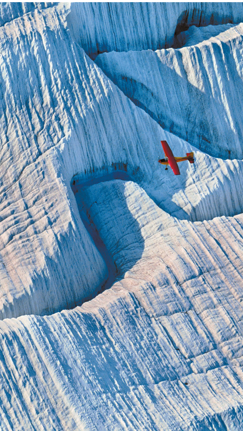
An aeroplane flies over a glacier in the Wrangell St Elias National Park in Alaska.

Researchers need more observational data to establish whether ice sheets are reaching a tipping point, and require better models constrained by past and present data to resolve how soon and how fast the ice sheets could collapse.