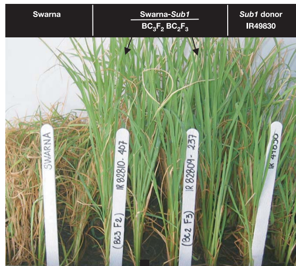
Figure 3 | Introgression of the FR13A Sub1 haplotype into an intolerant variety by MAS confers submergence tolerance. The Sub1 region donor line IR49830 (an FR13A derivative) was introduced into the submergence-intolerant indica variety Swarna by backcrossing (BC) with MAS using markers for the Sub1 region (SSR1, RM316, RM464, RM464A, RM219 and RM524) and the 12 chromosomes 25–27 . Individual F 1 plants were selected from BC 1 , BC 2 and BC 3 that carried the FR13A Sub1 haplotype with the least IR49830 background. Fourteen-day-old seedlings were submerged for 14 days and photographed 14 d after de-submergence.

The results presented here confirm that submergence tolerance is conferred by a haplotype of the complex Sub1 locus, with ectopic